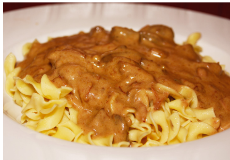
Pork Schnitzel: Choice of Wiener, Jager (pictured), Zieguener, or Kase